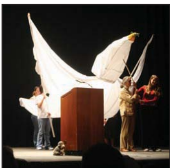
Dr. Goodall explains the message of the Peace Dove to the Salina audience