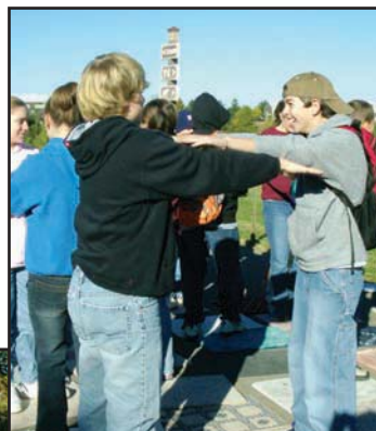
Getting fit with the Alphabet yoga at Rolling Hills Wildlife Adventure