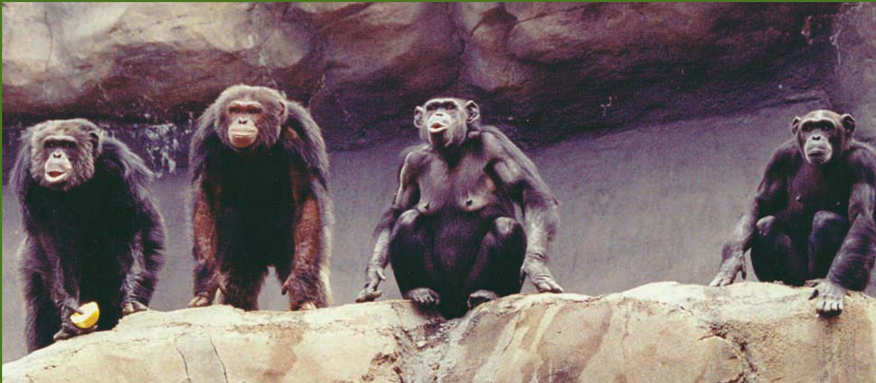
Photo of Judeo, Jerrard, Pandora and Gracie

The Los Angeles Zoo and Botanical Gardens is the proud host of the 2006 ChimpanZoo Conference. The Zoo moved to its present 80-acre location in 1966. The zoo population includes over 1200 animals and 7400 plants. The Zoo is a leader in conservation programs working with other AZA institutions and wildlife agencies to bring species such as the California condor, golden lion tamarin, and Arabian oryx, back from the brink of extinction.