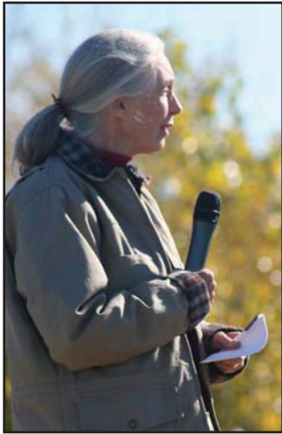
Dr. Jane Goodall addresses students at Chimpanzoo's Roots & Shoots event

It all began with Marbles, in his indomitable fashion, leading a curious and loudly vocalizing chimpanzee group that welcomed ChimpanZoo members to a pre-conference tour of Sedgwick County Zoo. Wichita's ChimpanZoo volunteers led the conference attendees across a fifty-foot suspension bridge to the amazing Nganda Island and African Downing Gorilla Forest.