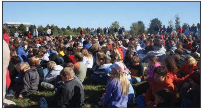
Students from the greater Salina area listen to Dr. Goodall's message of hope

inter-active science educational event for 700 students from the greater Salina area.